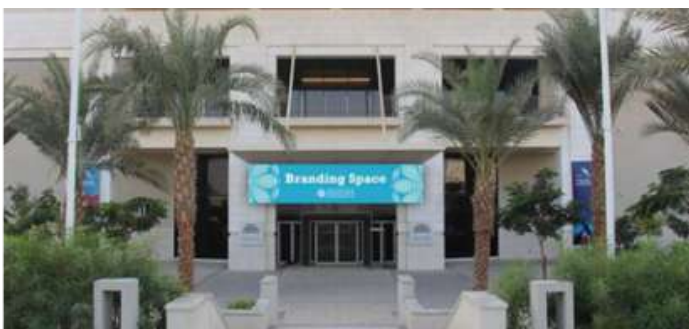
Banner Entrance Ballroom Building Side