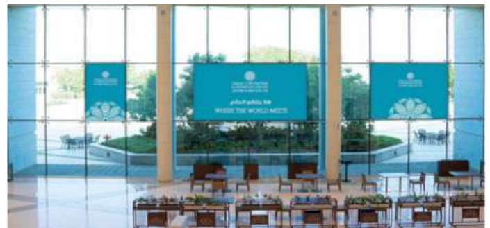
Exhibition Hall Entrance Pillar