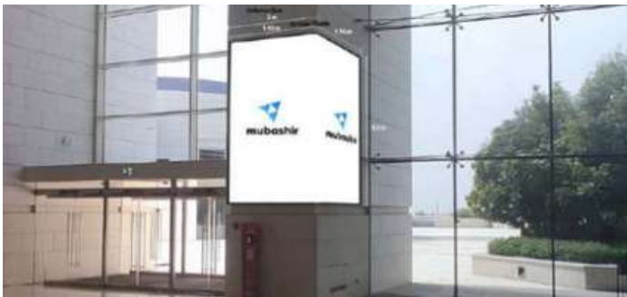
Ads on digital Billboards in Exhibition Area