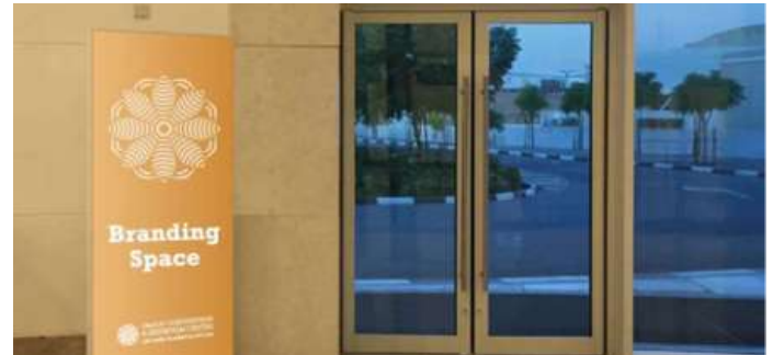
Backdrop Wooden Signage