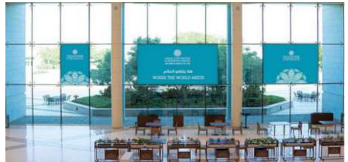
Exhibition Hall Entrance Pillar