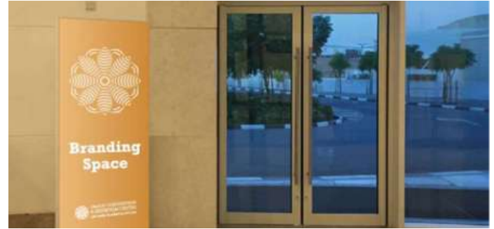
Backdrop Wooden Signage